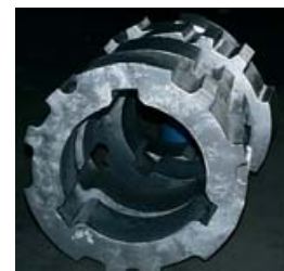
Claudius Peters Clinker Cooler Crushing Ring