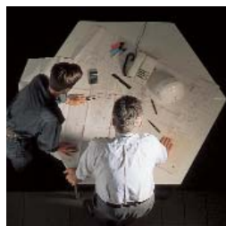
Claudius Peters Engineering Support