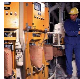
Service of Claudius Peters Packing Plant