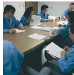
Maintenance training is provided