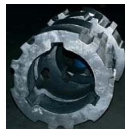
Claudius Peters Clinker Cooler Crushing Ring