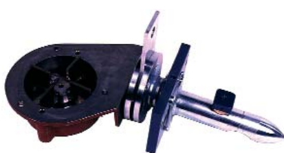
Claudius Peters Packing Plant Spares