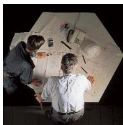
Claudius Peters Engineering Support