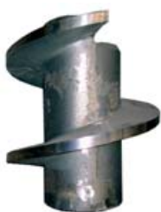
Claudius Peters Pump Spares