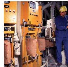
Service of Claudius Peters Packing Plant