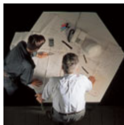
Claudius Peters Engineering Support