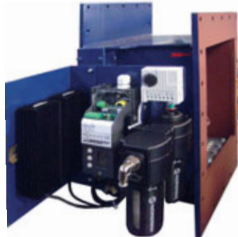
Integrated air tank for inconstant compressed air conditions on request