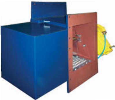
Special design for ambient temperatures under -40°C