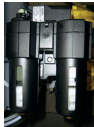
Preventive maintenance by air conditioning unit