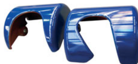
Different designs of cutouts for optimal throughput & function