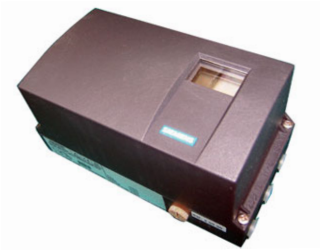
Basic control device