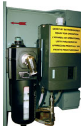
Detail of controller