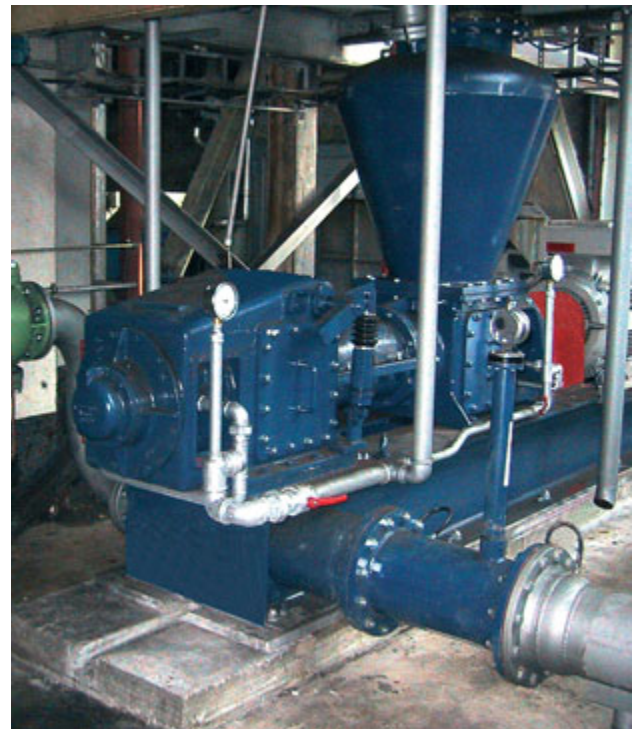
Highest flexibility in design of outlet points (example: left hand outlet)