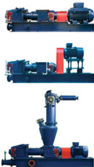
Variable design and power transmission

Conveying pressures up to approx. 2.5 bar overpressure, in special cases even higher, as well as conveying distances of up to approx. 1000 m and throughput capacities of up to approx. 400 t/h are achieved. It is possible to convey pulverized bulk solids as well as coarser materials with grain sizes up to approx. 10 mm. The X-Pump can be used as a feeder for dense-phase as well as for lean-phase conveyance.