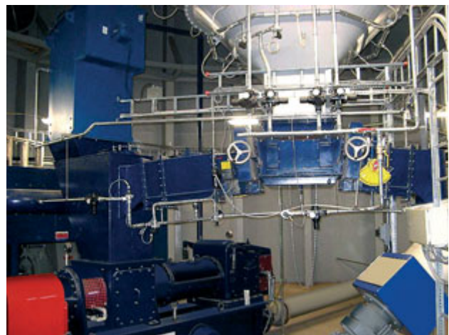
Feeding of X-Pump by Claudius Peters discharge equipment