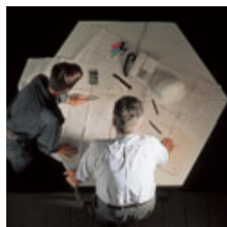
Claudius Peters Engineering Support