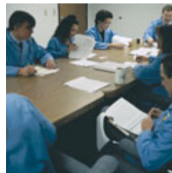
Maintenance training is provided