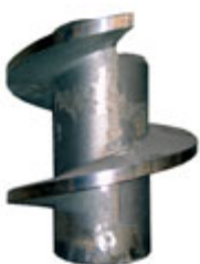
Claudius Peters Pump Spares

You can never be certain which spare parts will actually be required for the trouble-free operation of a new plant. We would like to help you with your decision. We supply recommendations for start-up, year 1 and year 2 of operation, for optimization of your plant and minimization of your stock keeping costs. With Claudius Peters you can check your stock keeping of spare parts after the first year of operation. For this purpose our experts would be pleased to meet with you in order to determine precise spare parts requirements.