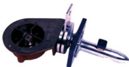
Claudius Peters Packing Plant Spares