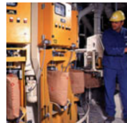
Service of Claudius Peters Packing Plant