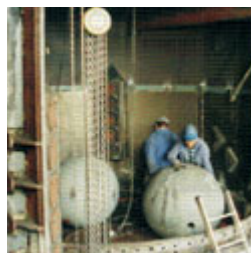
Service of Claudius Peters Grinding Plant