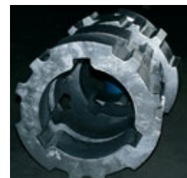
Claudius Peters Clinker Cooler Crushing Ring