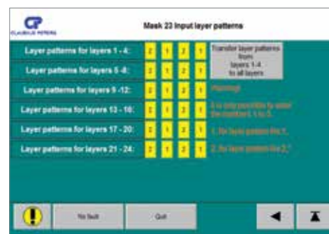
Preparing the different PACPAL palletizer layers