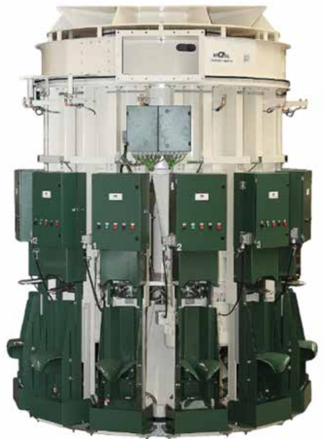
PACPAL Roto Fill

In order to avoid significant bottlenecks during the changeover to 25 kg bags in the entire production process, but also to achieve the desired total sales volume, the machine technology and the system concept must be adapted and optimized. In a classical packing and palletizing plant the packing machine, the automatic bag applicator, the downstream belt conveyor, the palletizer as well as the feeding system of the packing plant will need to be considered.